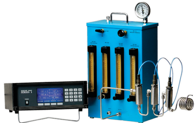
MG101 with Moisture Image® Series 1 analyzer to demonstrate moisture sensor calibration