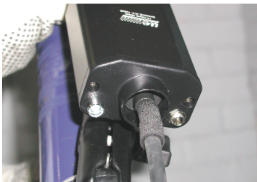
ADDED FEATURE! Spotlight brightens up dark areas.