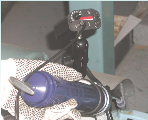
The Ultraprobe 201 Grease Caddy SWIVELS left/right and up/down for difficult angles