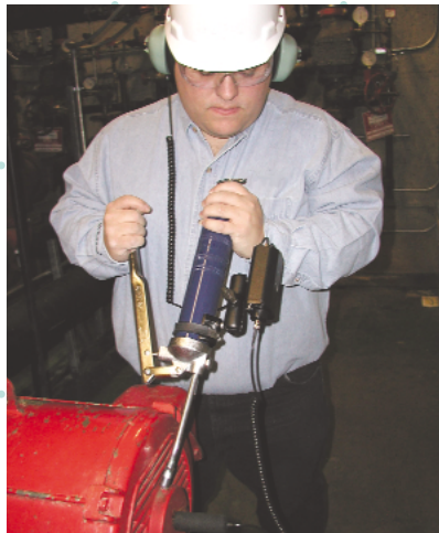
Listen while applying grease

As lubrication levels fall, friction levels