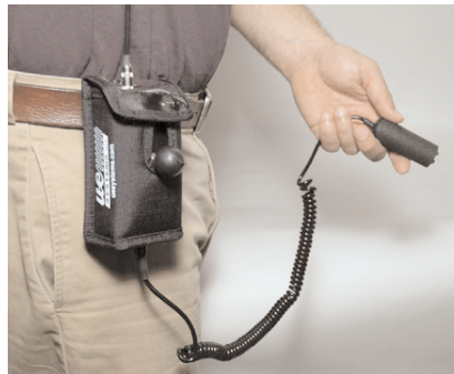
Optional belt holster for easy use