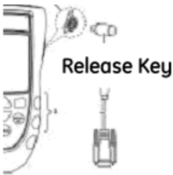
Data Logging Release Key

The data logging feature is supplied as an upgrade kit (option I0800E on the datasheets). This feature is standard with the DPI 820 and is now available as an option for all other DPI8XX models. Existing units with firmware version 5 or higher can be upgraded in the field. The data logging function contains a release key, RS232 lead and user guide.