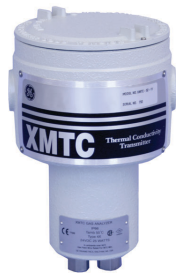
XMTC thermal conductivity gas transmitter