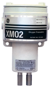
XMO2 thermoparamagnetic oxygen transmitter

The TMO2D is an optional display and control module that enhances the performance and operation of transmitters such as the XMO2, XMTC or O2X1. It provides a two-line x 24-character backlit LCD display, display and option programming via keyboard, recorder outputs, alarm relays, and relays for driving sample system solenoids for automatic zero and span calibration, as well as a 24 VDC power supply for the transmitter. The TMO2D also provides microprocessor-based oxygen signal compensation for improved accuracy for the TMO2 transmitter.