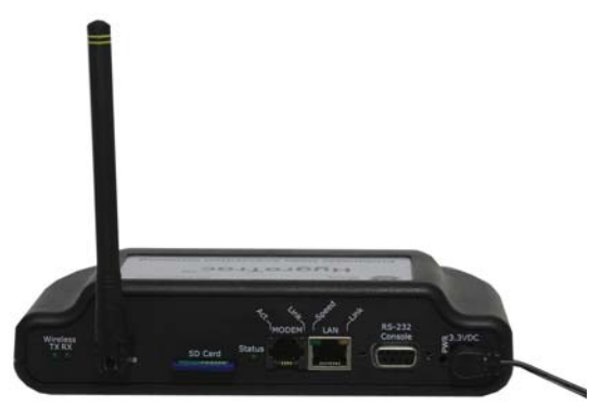
HygroTrac gateway rear view

*Use of dial up connections will require an ISP account.