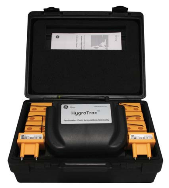
HygroTrac in carrying case

This product complies with FCC Part 15 Class B, ICES-003 Class B, European Union EMC and R&TTE Directive. Wireless devices require specific country approvals. Contact GE Sensing for the latest listing.