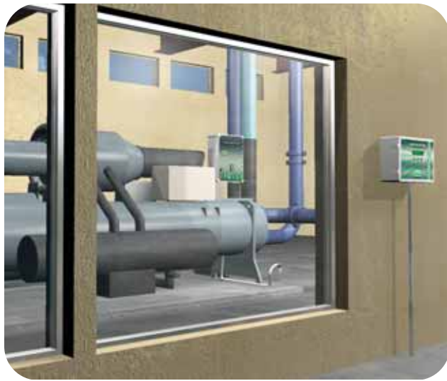
Gas Monitor Remote Display located outside of mechanical room provides entry way signaling.